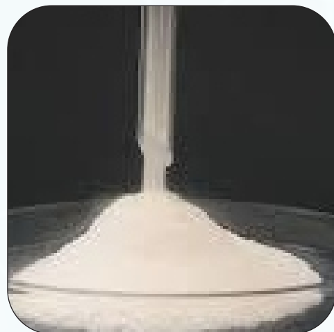
Betamethasone Valerate Usp