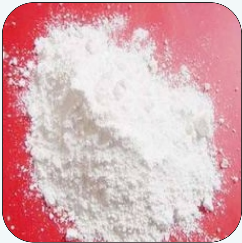
Dried Aluminium Hydroxide GEL IP