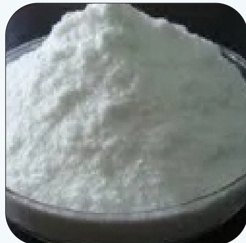
Bromo Indole 5