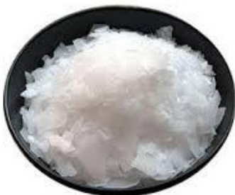
Magnesium Chloride Flakes