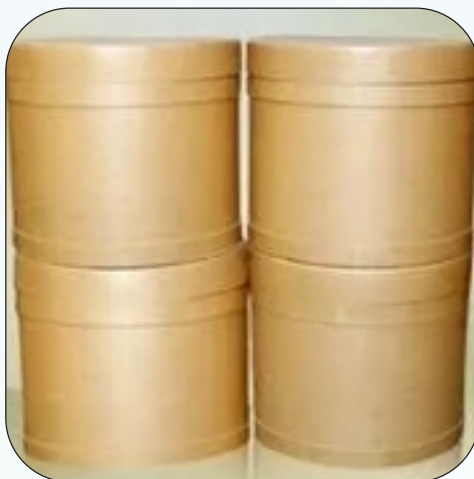
Cyano Indole 5